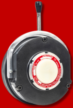
SERIES: USB / UMB